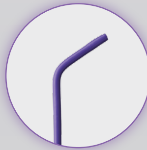
2 RO Bern Shape